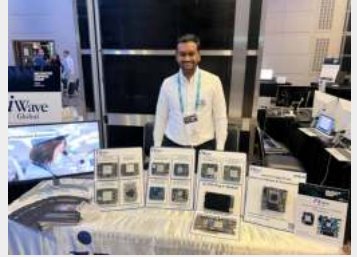
AMD Adaptive Computing Summit London