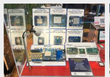
SAHA Aerospace & Defense Expo Turkey